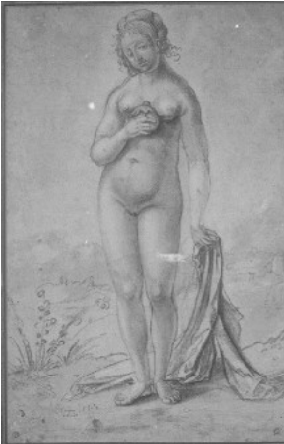
Figure 4 Drawing by Lucas CRANACH(I)